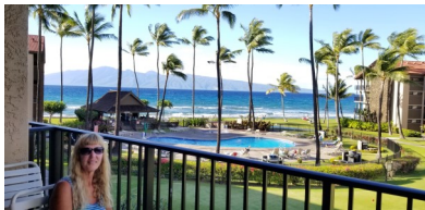
Jan/Feb in Maui —ALOHA!