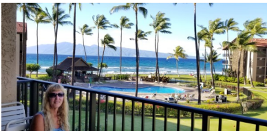
Jan/Feb in Maui —ALOHA!