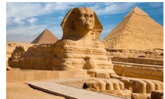
Treasures of Egypt 10/21