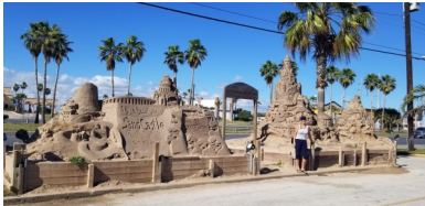
South Padre Island, Texas