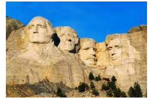
Mount Rushmore 9/21