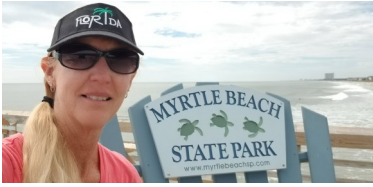
Myrtle Beach, South Carolina