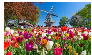
Tulip Time Rhine Cruise 4/22