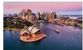
Australia/New Zealand 2/22